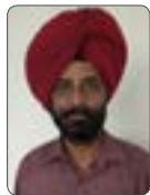
N. S. Neki Government Medical College and Guru Nanak Dev Hospital, India