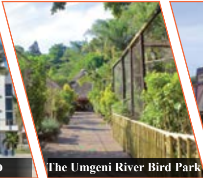
The Umgeni River Bird Park