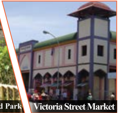
Victoria Street Market