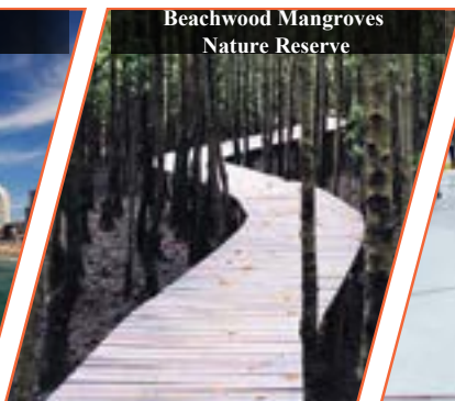
Beachwood Mangroves Nature Reserve