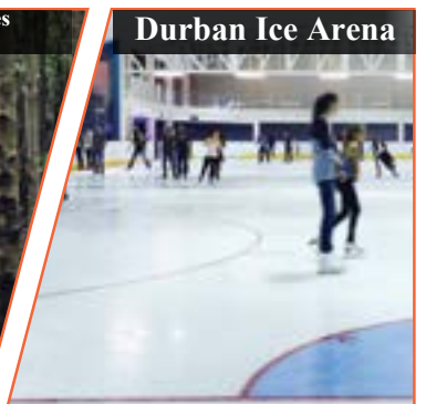
Durban Ice Arena