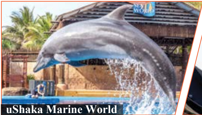
uShaka Marine World