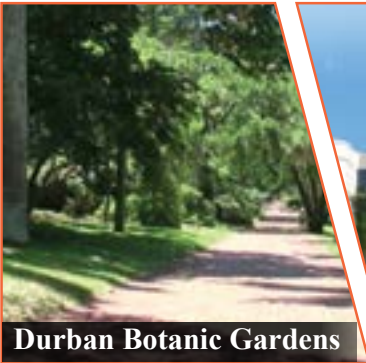
Durban Botanic Gardens