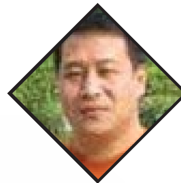
Yue Ge National Health and Environmental Effects Research Laboratory US Environmental