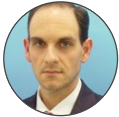
George Boraks Carmino Caricchio Trauma Hospital, Brazil