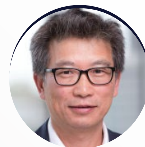
Long R Jiao Imperial College London UK