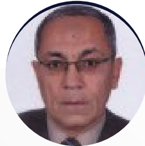
Baher Abdel Khalek Mahmoud Effat National Research Center Egypt