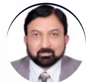
Mohammad Kamil Zayed Complex for Herbal Research and Traditional Medicine UAE