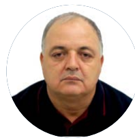
Mouloud Kecha University A.MIRA of Bejaia