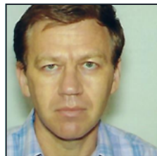
Ben Zion Dekel Ruppin Academic Center, Israel