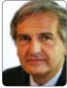
Paolo Gottarelli Plastic surgeon, President of IO BREATH, Italy