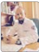
Mohammed Hojoui Medical Academy of Health Ministry of Ukraine, Ukraine