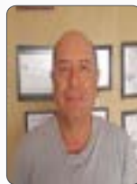
Chair Antonio Rodríguez Valencia Michoacán University of San Nicolás de Hidalgo, Mexico